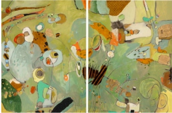
Sur La Table, acrylic diptych by Nanct Towne Schultz at The Loft, 401 South Mesa, third floor (26)